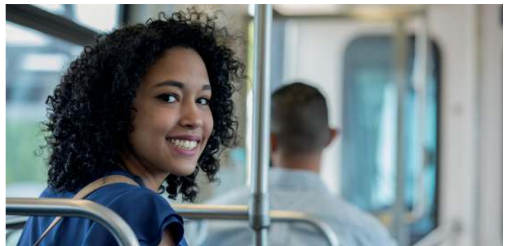
My life and home

Some people go by bus very early in the morning. I get the bus at 8.15.