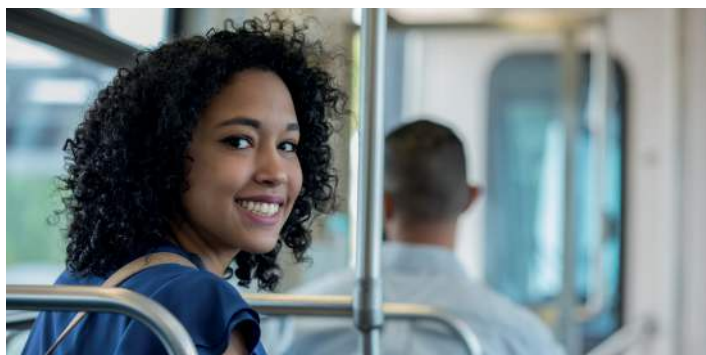
My life and home

Some people go by bus very early in the morning. I get the bus at 8.15.