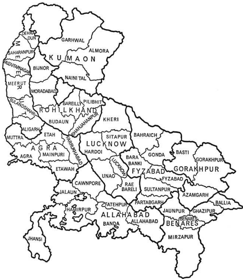
Map 2 Map of Uttar Pradesh (formerly the United Provinces)