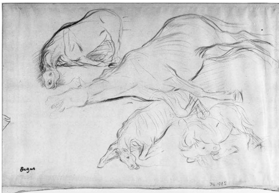
3. Edgar Degas, Studies of Horses (ca. 1866). Black chalk, 23.2 × 35.6 cm. Sterling and Francine Clark Art Institute, Williamstown, Mass. (1955.1391).

repeat its motion, thickening the substance of a line, adding to its material as well as visual weight; the resulting line might then brake its directional momentum, becoming by its very thickness less a directed trace than a spreading mark, an object in its own right. Such an expansion of its own inner field modulates the directional impulse of the line, effectively diffusing linear energy laterally, over a broader spread of surface. When a contour becomes so heavy, when it thickens across its directional axis, blunting its own momentum, we may speak of a “pictorialization” of the line – an extension into painting of the line of Parrhasios.