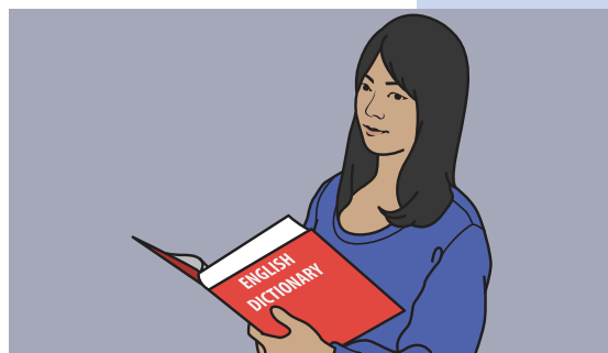
4 Koko _____