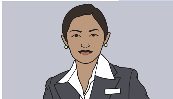
2 Nehir _____