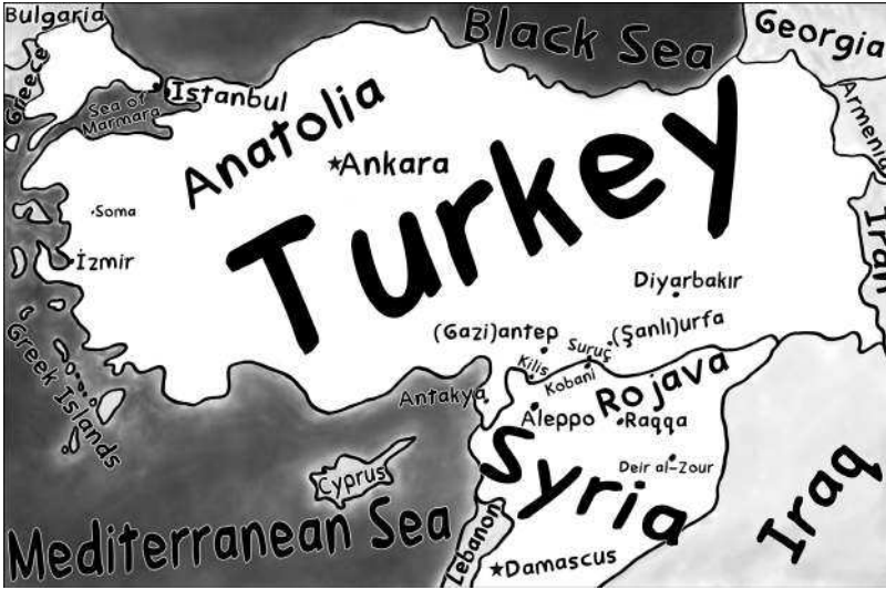
Figure 0.1 Map of Turkey and Syria