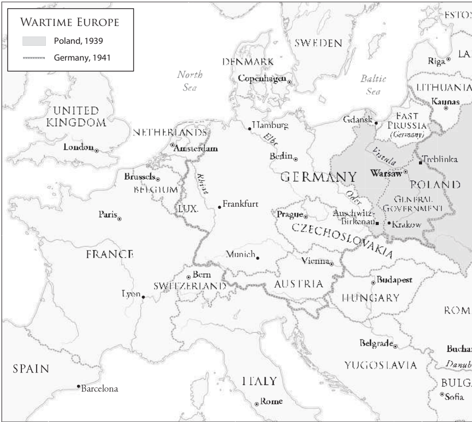
Figure 0.1 Map of Nazi-Occupied Europe

Cambridge University Press 978-1-316-51558-7 — Survivors Jadwiga Biskupska Frontmatter More Information