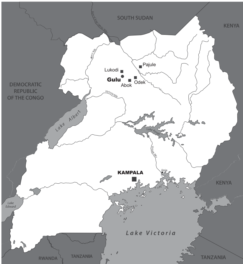
i.1 The four massacre sites formally included in the ICC case The Prosecutor v. Dominic Ongwen