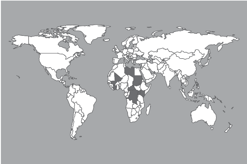
i.3 Countries and regions that are the location of crimes tried in ongoing and completed cases before the International Criminal Court as of April 2021 (in gray)