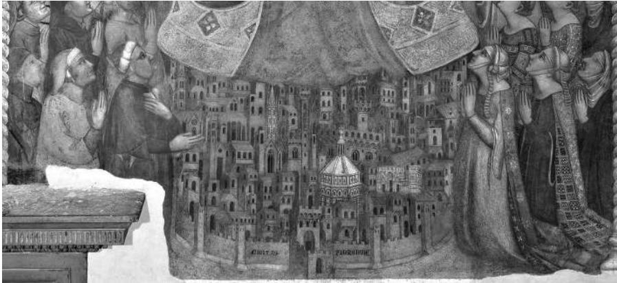
1.4. School of Bernardo Daddi, Madonna of the Mercy , fresco, 1342 (detail). Florence: Bigallo.

in the first part of his Panegyric to the City of Florence ( Laudatio florentinae urbis ; 1403–1404). 35 According to Bruni, two achievements distinguish Florence from other contemporary cities: its “unparalleled cleanliness” and its magnificent architecture. While “every other city is so dirty that the filth created during the night is seen in the early morning by the population and trampled under foot in the streets,” in Florence there is nothing “disgusting to the eye, offensive to the nose, or filthy under foot.” 36 Bruni continues “if we are looking for contemporary architecture, there is surely nothing more splendid and magnificent than Florence’s new buildings” and turns to the architectural image of Florence, its public spaces and buildings as well as private houses and villas. 37 Bruni examines the urban image of Florence for political ends – to proclaim the superiority of this most modern and beautiful city and to legitimize its dominion. Architectural achievements become a touchstone for the greatness of the Florentine people. At the sight of Florentine architecture, one “immediately comes to believe that Florence is indeed worthy of attaining dominion and rule over the entire world.” 38 For the same reasons, in the second part of the Panegyric , Bruni develops the idea that Florence was founded by ancient Romans: “your founder is the Roman people – the lord and conquer of the entire world.” 39