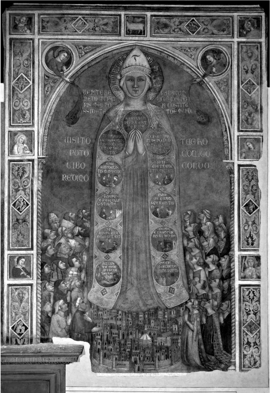
1.3. School of Bernardo Daddi, Madonna of Mercy , fresco, 1342. Florence: Bigallo. Color version available online.

works in progress. Even Salutati, as he describes their future destruction, first pays tribute to the city's architectural achievements.