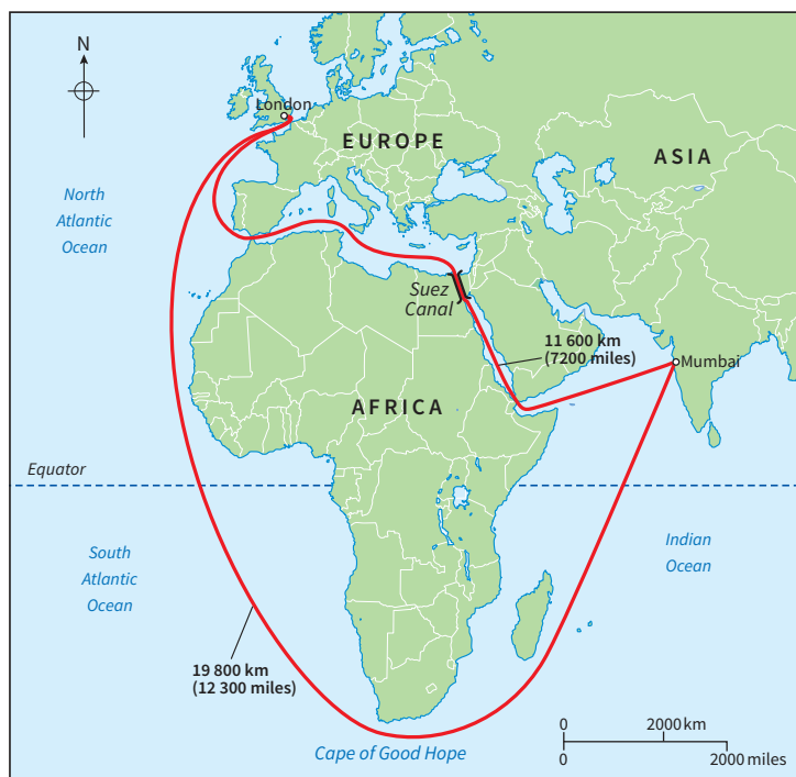
Figure 2.2: The routes between Britain and India via the Suez Canal and via the Cape of Good Hope.

India also served Britain's political and economic interests in other parts of the empire. Indian soldiers, paid for by Indian tax payers, were used to protect trade routes and serve British interests in China, East Africa and the Middle East. In the 20th century, large numbers of Indian soldiers provided military support for Britain in both world wars. India also served as a source of indentured labourers for British colonies in the West Indies, Africa and other parts of Asia.