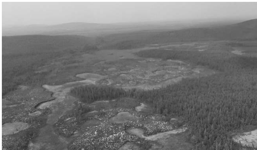
FIGURE 1.3 The Tunguska epicenter from a helicopter in 2018.

spotting the scene. From this vantage point I found the land breathtaking and invigorating but not strange or surprising. In contrast to the scene that I asked you to envision shortly after the blast, the revived environment of 2018 no longer immediately revealed the traces of a cosmic collision. The landscape charmed me with its history and beauty but did not quite evoke the same sense of wonder as it had for so many observers in the past. Part of me really wishes that it had.