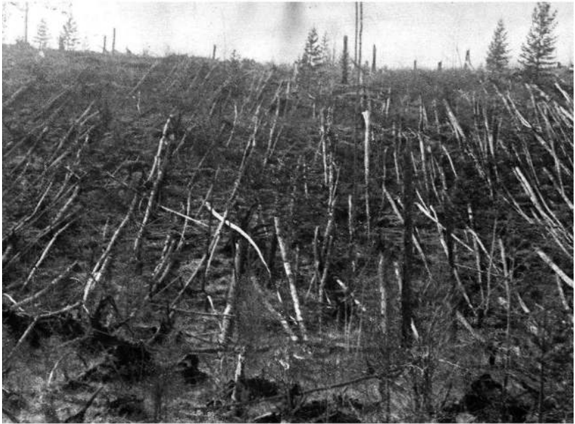
FIGURE 1.1 Rows of trees fallen from the blast in the 1920s.