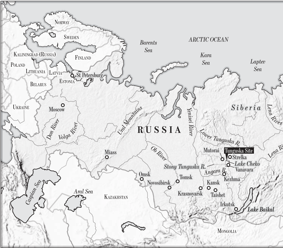
MAP 1.1 The Tunguska site in Russia.