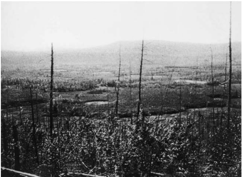
FIGURE 1.2 Bare trees standing at the site in the 1920s.