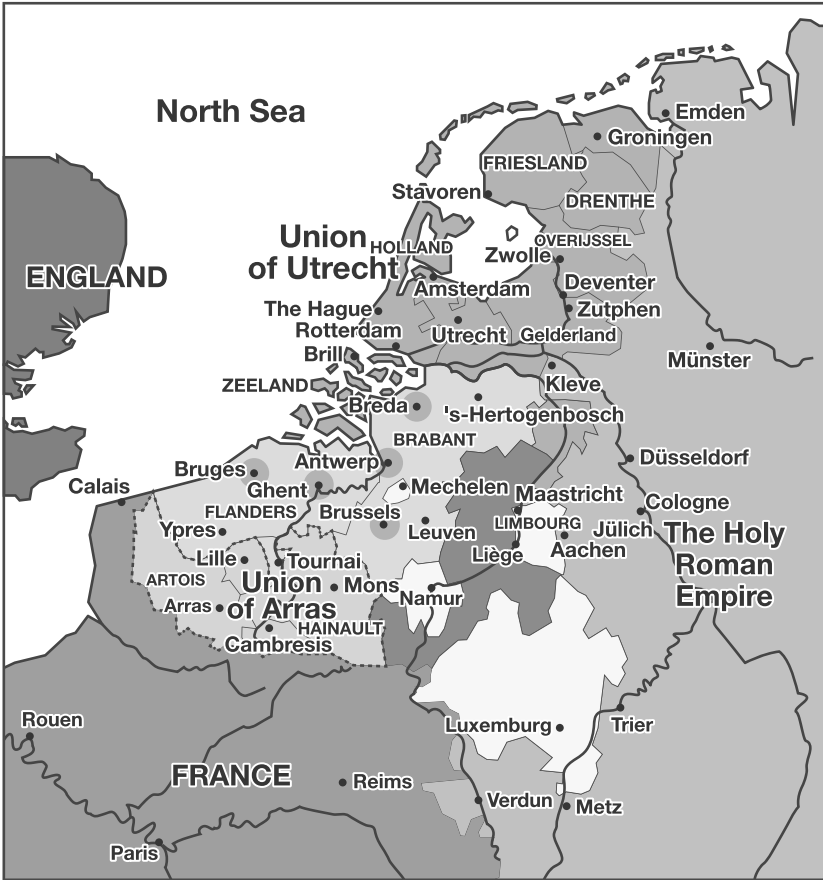
1 Alliances in the Low Countries during the Dutch Revolt (1579).