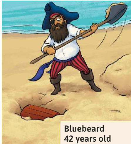
Bluebeard 42 years old Pirate for 20 years