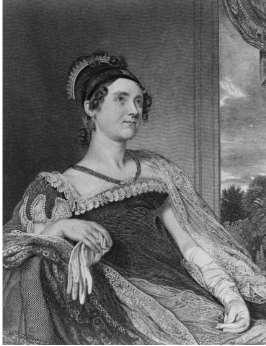
Figure 0.1 Louisa Adams (Mrs John Quincy Adams), 1852.

nineteenth century, women were increasingly found on the roads without their husbands or masters, which points not only to (civil and female) emancipation but also improved road security.