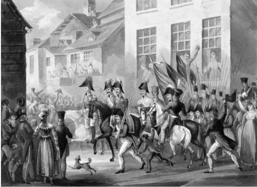
Figure 1.1 The Allied entry into Paris, 31 March 1814. By Thomas Sutherland, 1815. (Heritage Images)

Revolutionary and Napoleonic Wars had achieved something unprecedented. Not only had they forged the European states together into a wartime alliance against the Bonapartist Grande Armée . But even after the conclusion of the armistice and the first peace treaty, the Grande Peur that survived after all these years of warfare pushed the powers closer together than ever before. 5 The philosopher Immanuel Kant had speculated on the possibilities of world peace; pundits and publicists had designed blueprints for a post-war federation of European states. But these plans had never reached the baize-covered tables of Europe's diplomats and ministers. The Vienna Congress, convening from September 1814 until June 1815, consolidated the existing wartime alliance and deliberated on the new, post-war peace order. However, contrary to received wisdom, rather than the Vienna Final Act, it was two other treaties that were to be concluded a couple of months later that contained and cemented the real revolutionary requisites for this new post-war security system: the Treaty of the Quadruple Alliance and the Second Treaty of Paris,