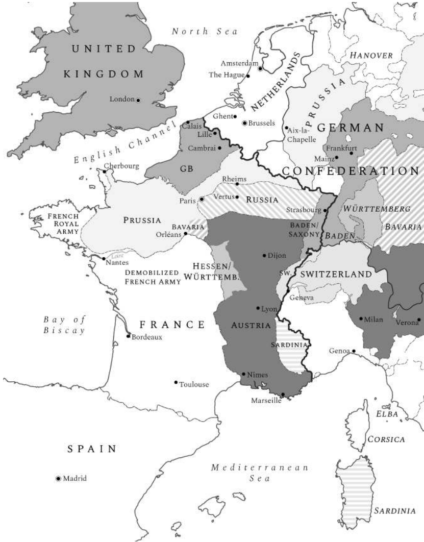
Map 0.2 The Allied occupation of France, July–December 1815. (Erik Goosmann © 2020, Mappa Mundi Cartography)