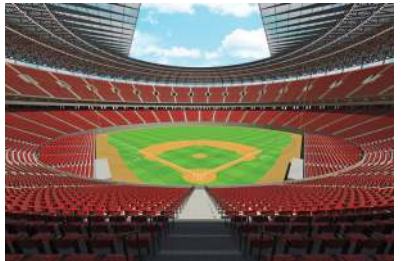
at the stadium