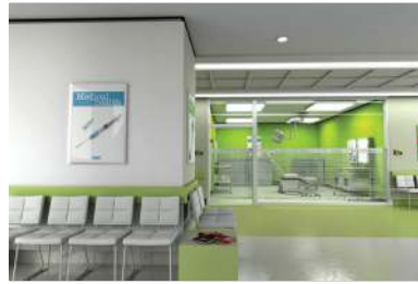
at the doctor's office