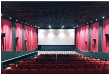
at the movies