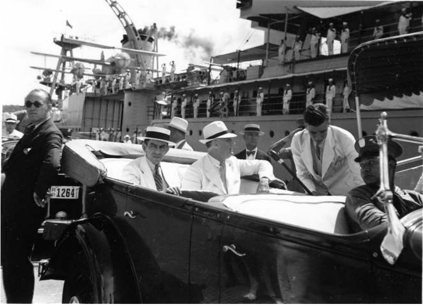
FIGURE 1.2 Presidents Harmodio Arias and Franklin Delano Roosevelt during visit to Panama in 1934.

1920s: equal pay and benefits for Panamanian employees, repatriation of laid-off foreign workers, ending eminent domain land annexations, and barring commissary and restaurant sales to non-employees. These and other issues proved serious enough to require treaty negotiations, which Roosevelt assigned to the State Department. 10 The following year Roosevelt reciprocated with a visit to Panama.