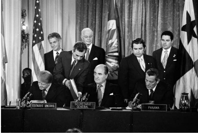
FIGURE 1.1 President Jimmy Carter and General Omar Torrijos signing the historic 1977 Panama Canal Treaties.