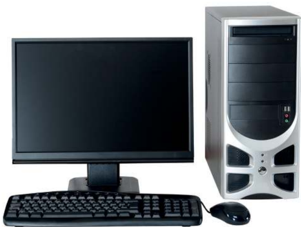
Figure 1.01 Typical computer system

First, you will learn about hardware and software and the difference between them; next you will look at the hardware components of a computer system, then at some of the different operating systems. Finally you will consider emerging technologies and the type of impact they have on everyday life.