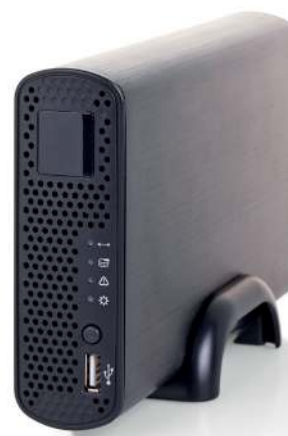
Figure 1.03 Hard drive

A hard disk drive (see Figure 1.03) is for storing programs and data. The computer can read from and write to it. (When we say 'read from', it means being able to open a file from the hard disk and load its contents into memory; 'write to' means that we can save to the hard disk.) There are different types of disk drives but they generally work by spinning a disk and using a drive head to read/write. For hard drives a magnetic head is used.