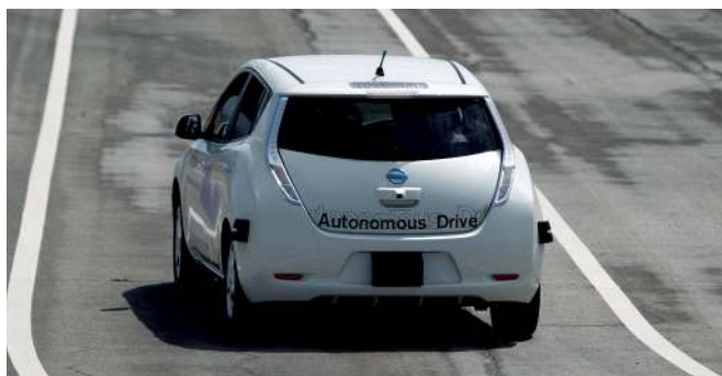
Figure 1.08 A driverless car

Driverless cars are guided by GPS, WiFi and spatial laser sensors (see Figure 1.08). A car without a driver? What