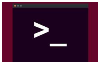
Figure 1.04 Command line interface showing prompt

A different way of interacting with the operating system is by using a command line interface (CLI) . This allows the use of commands such as COPY and RENAME for copying files and changing their names. The commands are accepted and executed by a part of the operating system called the command processor or command line interpreter.