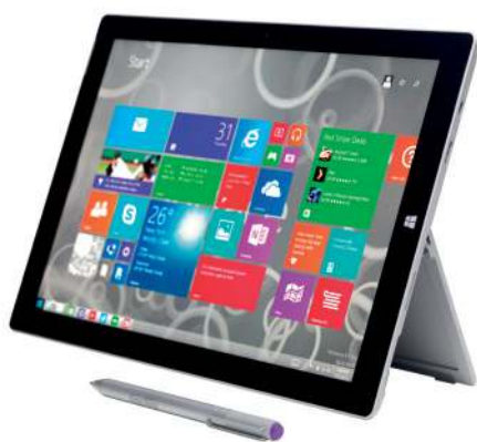
Figure 1.06 A graphical user interface

You will have seen that a GUI uses graphics to stand for more complicated actions that the user wants the computer to carry out (see Figure 1.06).