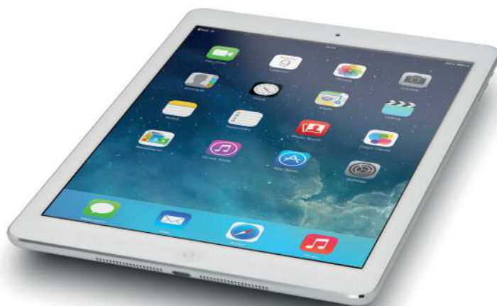
Figure 1.07 Portable computing: (a) a laptop (b) a tablet