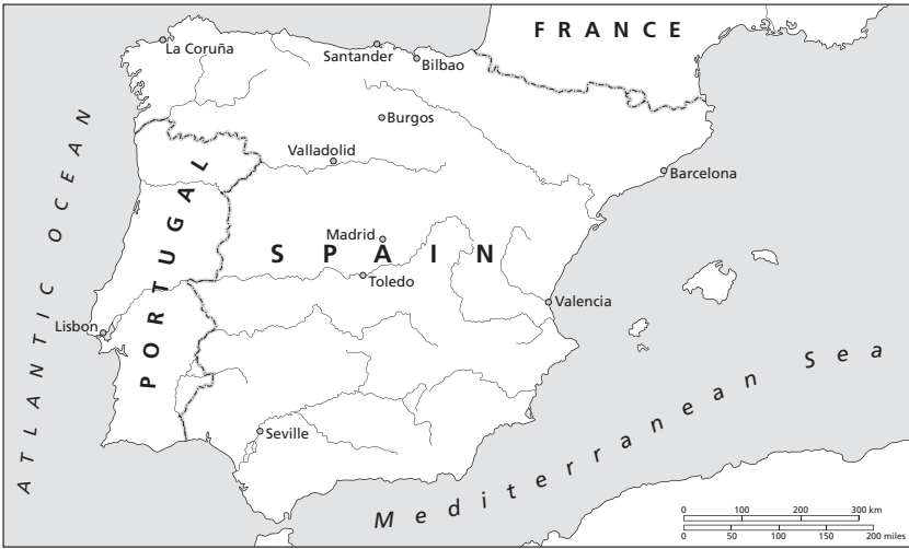
1. Map of selected towns mentioned