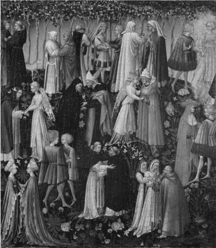
Figure 1.2 Giovanni di Paolo di Grazia (Italian, Siena, 1398–1482) / Paradise / 1445/ Image ID: KCD1RT / Photo: Artokoloro/ Alamy Stock Photo.

in so doing, coming to be alienated from the creation of which we are a part. It is also a story of returning to God, and to the Edenic state of one's proper place in that creation.