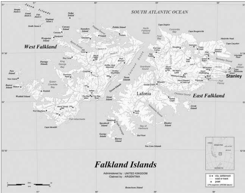
Falkland Islands (British place names). © Eric Gaba.