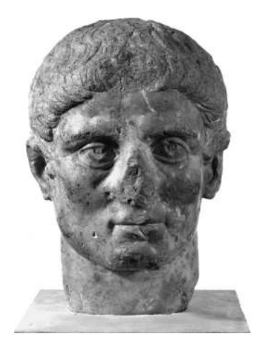
I.I. Bolsena Octavian.Rome, Museo di Nazionale Etrusco di Villa Giulia inv. no. 104973A

and aging face of his short-lived successor, Nerva. Stefania Adamo Muscettola associates the statue with an inscribed statue base that left a negative impression on the temple podium. The imprint records a dedication to Domitian in 94/95 CE that had been turned upside-down and replaced with a dedication to Nerva, and thus provides a public makeover that parallels that seen in the statue.<sup>5</sup> If the transformed equestrian statue of Nerva stood atop this statue base, then we know that the repurposed portrait with conspicuous residual Domitianic features - including the hair and inscription - was prominently displayed beside the temple, drawing attention to the reworking.6 But outside of such clear-cut cases, where the same audience would see the changed statue and in which the traces of the statue's original appearance were evident and the inscription identifying the subject also deliberately