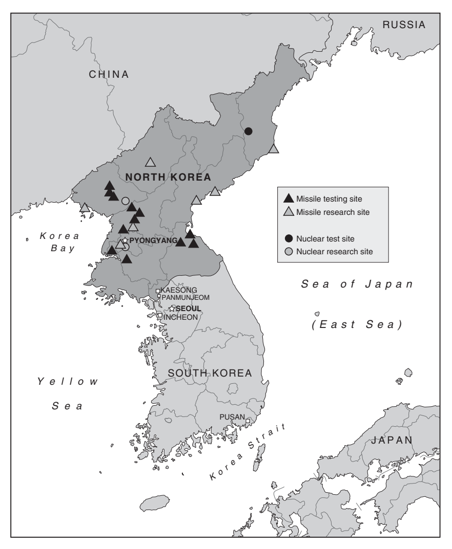
Map 1 The Korean Peninsula in 2018.