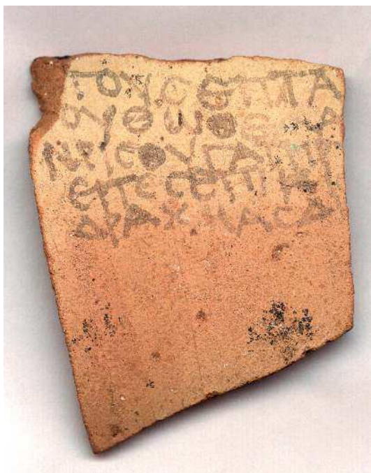
1.2 Receipt for 4 drachmas written on a potsherd, dated to the Egyptian month of Thoth ( P.Duk.inv. 233).