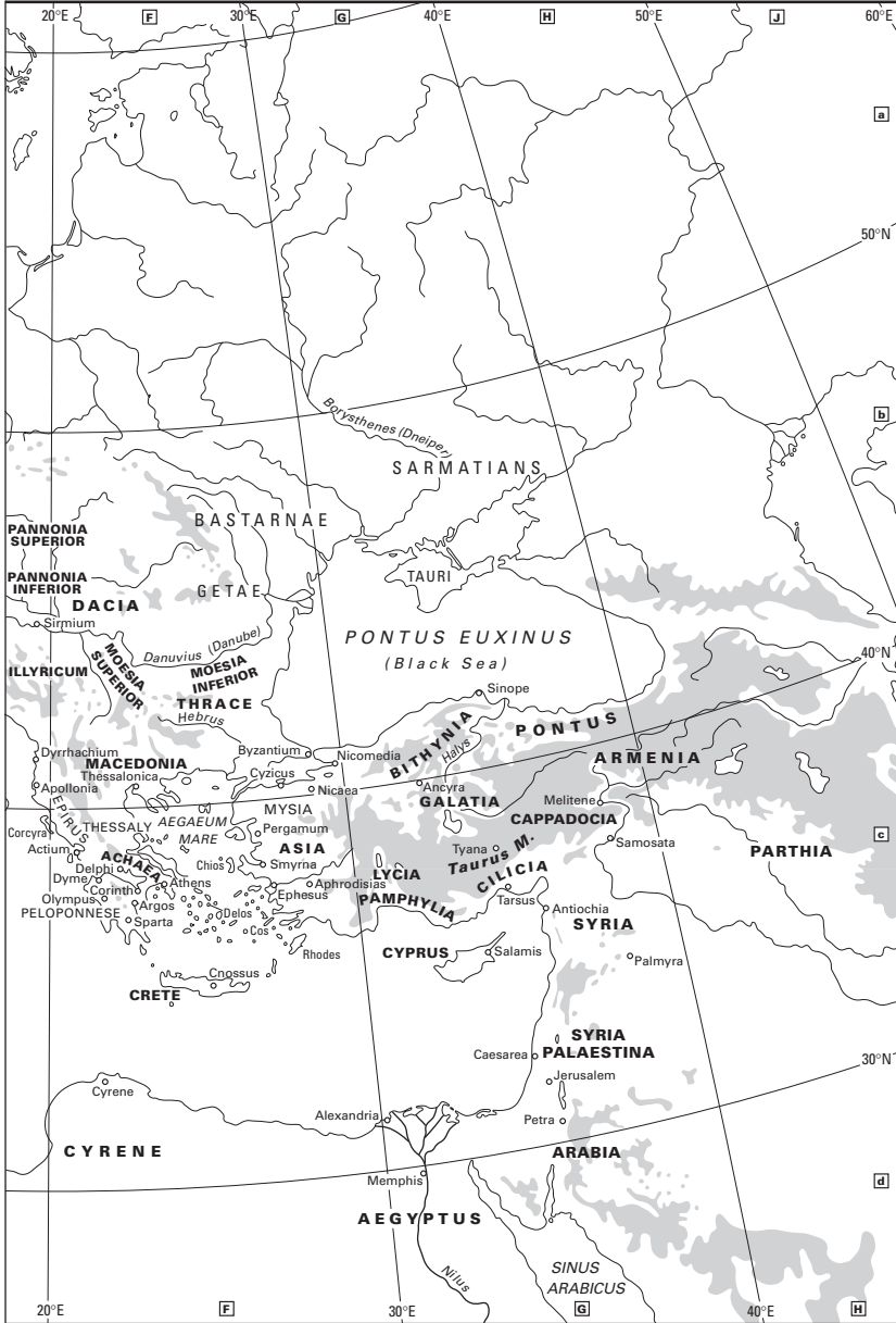
Eastern Roman Mediterranean.