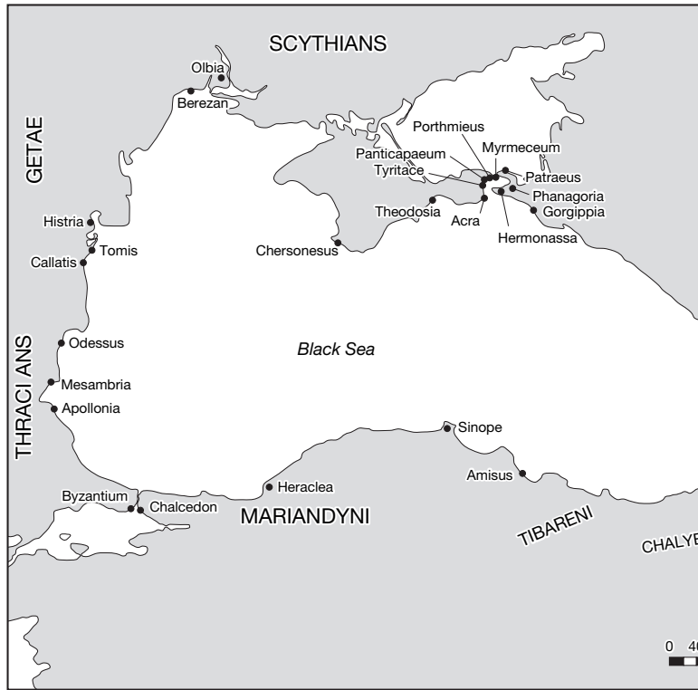
MAP 0.2 The Black Sea