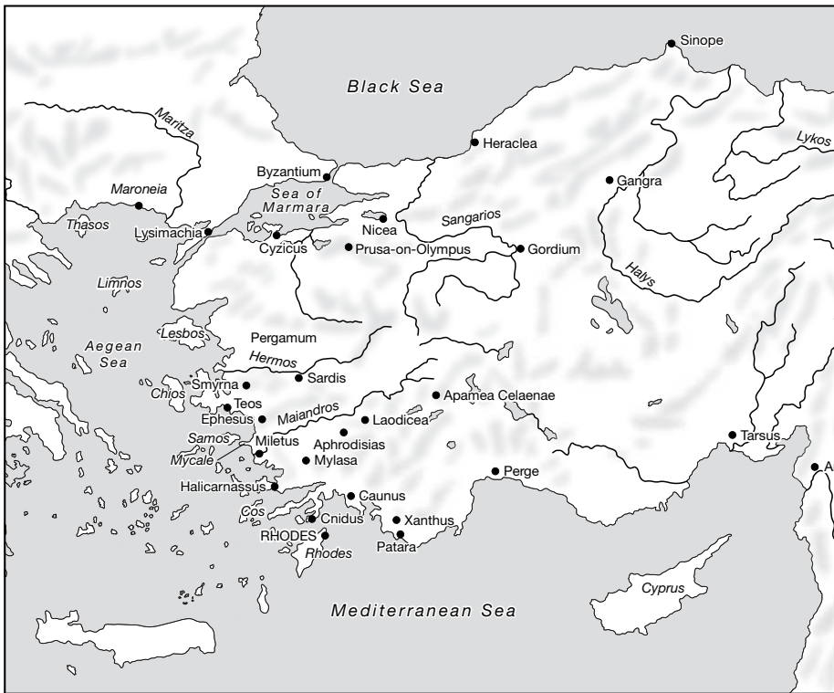
MAP 0.3 Asia Minor