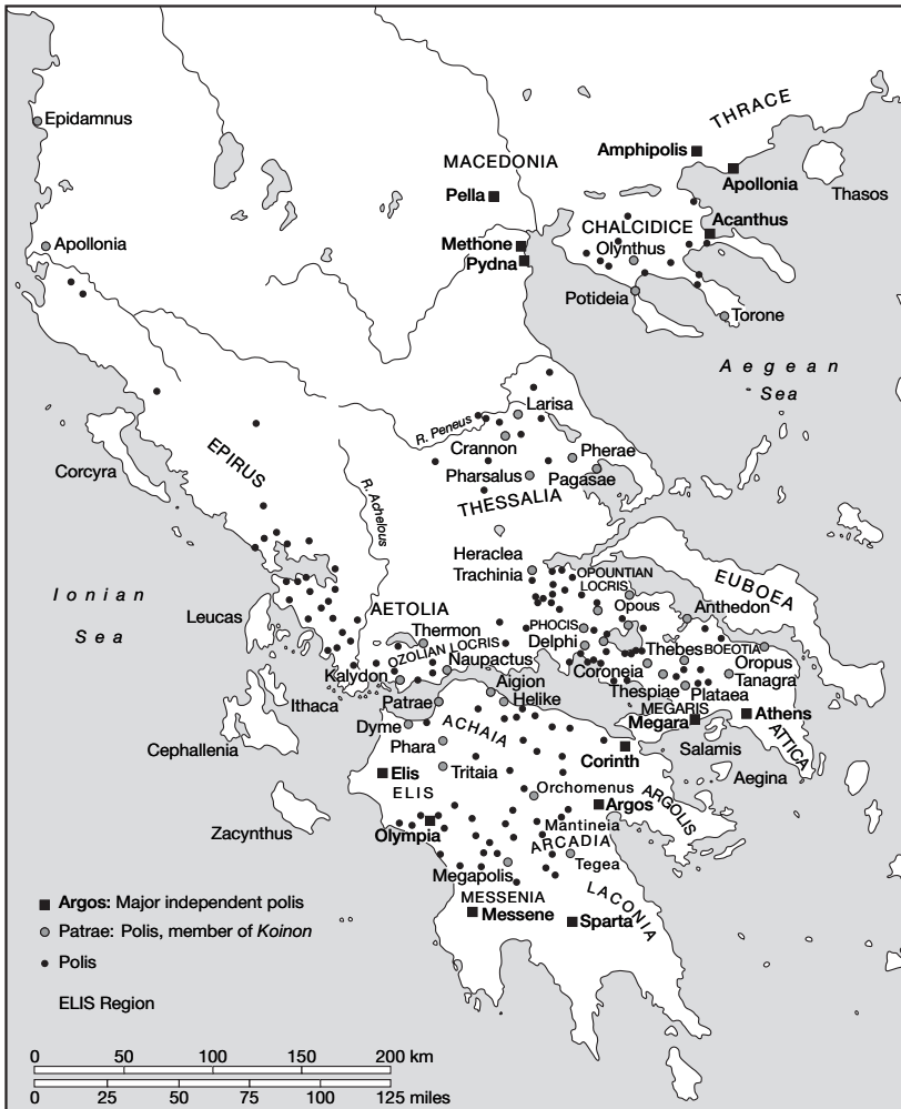
MAP 0.1 Greece and the Aegean