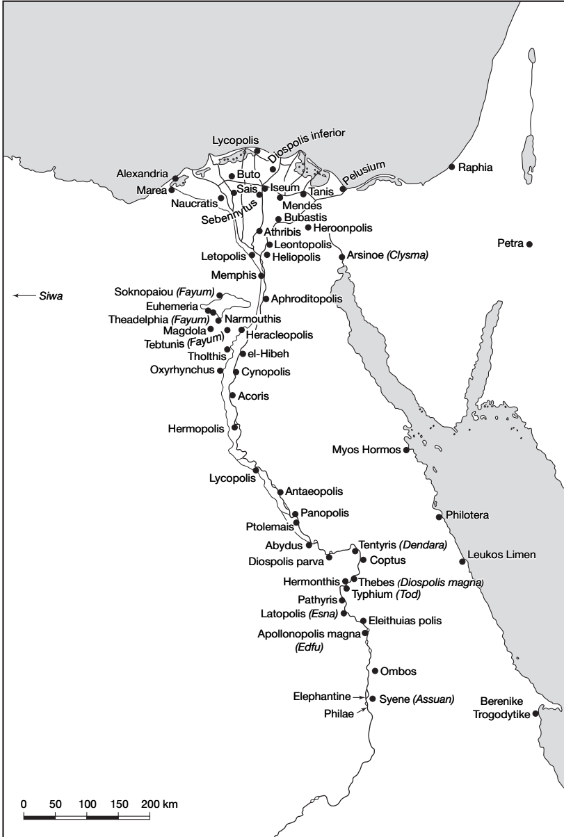
MAP 0.4 Egypt