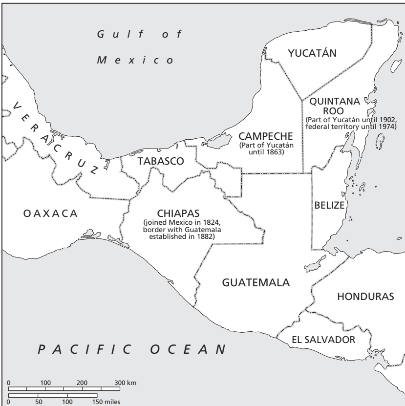
Map 1 The Mexican Southeast

At the turn of the century, the Southeast was not a region that seemed likely to produce a highly influential school of revolutionary reform. In those years it was a region legendary for the wealth it produced, and notorious for the de-facto enslavement, systematic oppression, and political marginalization of its large indigenous population. The Southeast was far removed from Mexico City as the crow flew, but also crippled in many parts by a lack of transportation infrastructure across an often difficult terrain that was divided by rivers, canyons, and mountain ranges in some places, and by wetlands and bodies of water in others; in the early twentieth century, travel both to and within the region was often difficult and sometimes outright impossible. It was also a part of Mexico with