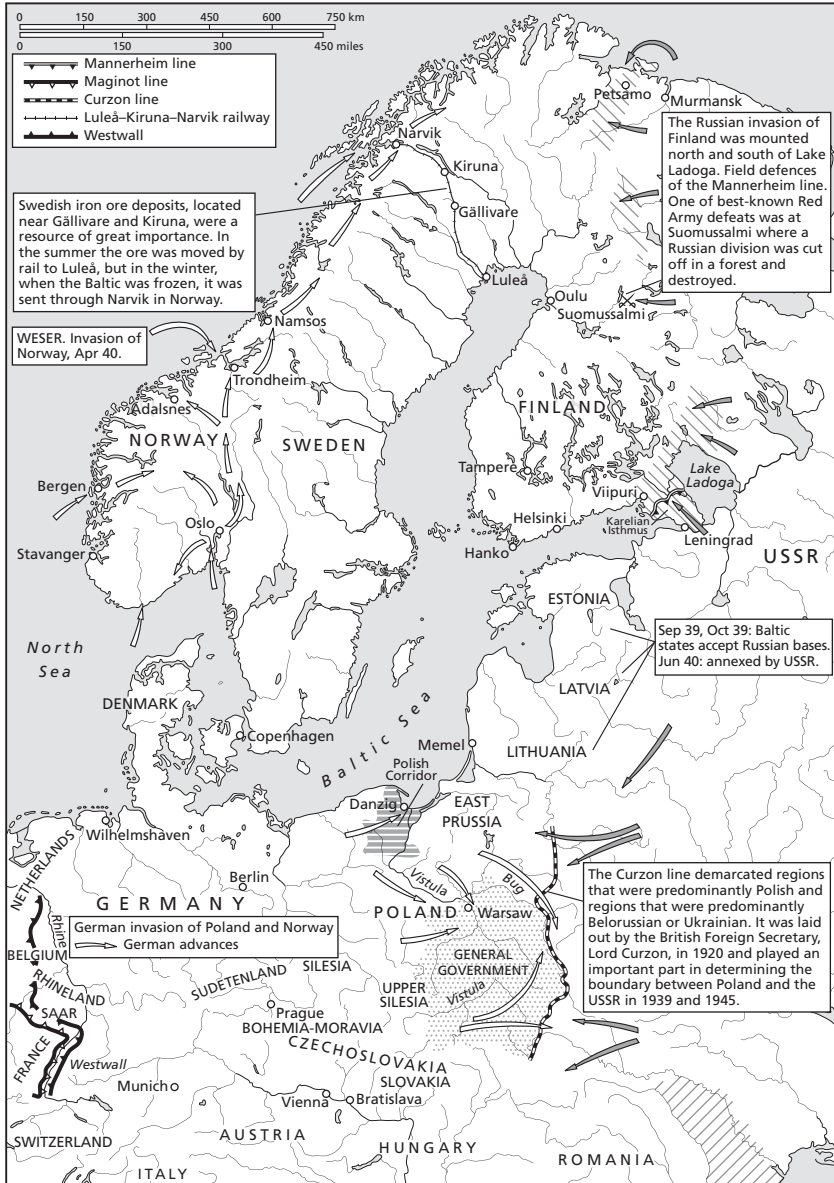
0.3 German advances by diplomacy and conquest, 1936–41