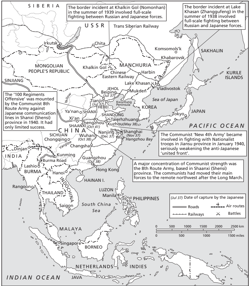
0.2 Japanese advances by diplomacy and conquest, 1937–41