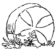
Sepulchral Headstone Cross, Brockhall, Northamptonshire.