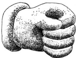
Stone Candlestick, Upton Castle Chapel, Pembrokeshire. Page 65 ante.