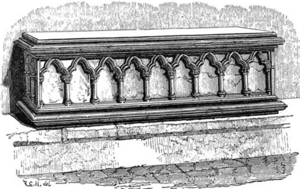
Sepulchral Monument, Westminster Abbey. 14th Century.

Amiens cathedral, 81. Blanche Mortain abbey, 243. Clairvaux, 187. Neocesarea, 6. Oisnot, 228. St. Chapelle, Paris, 228. St. Denis, Paris, 166. Tyre, 7. Vienne, St. Laurence, 164.