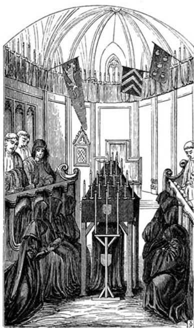
Funeral and Ancient Funeral Hearse; from a French Illuminated MS., 15th Century.