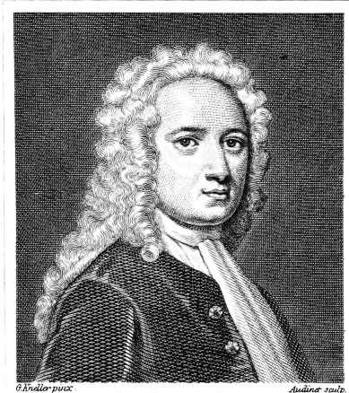
W Sturkoby M.D. F.R.S. F.S.A. — Born 1687; died 1765.

Published by J. Nichols & Co. Feb. 16, 1817.