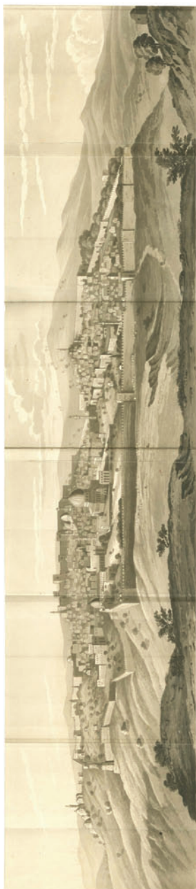
Jerusalem from the Base of the Sepulchre on the Mount of Olives.