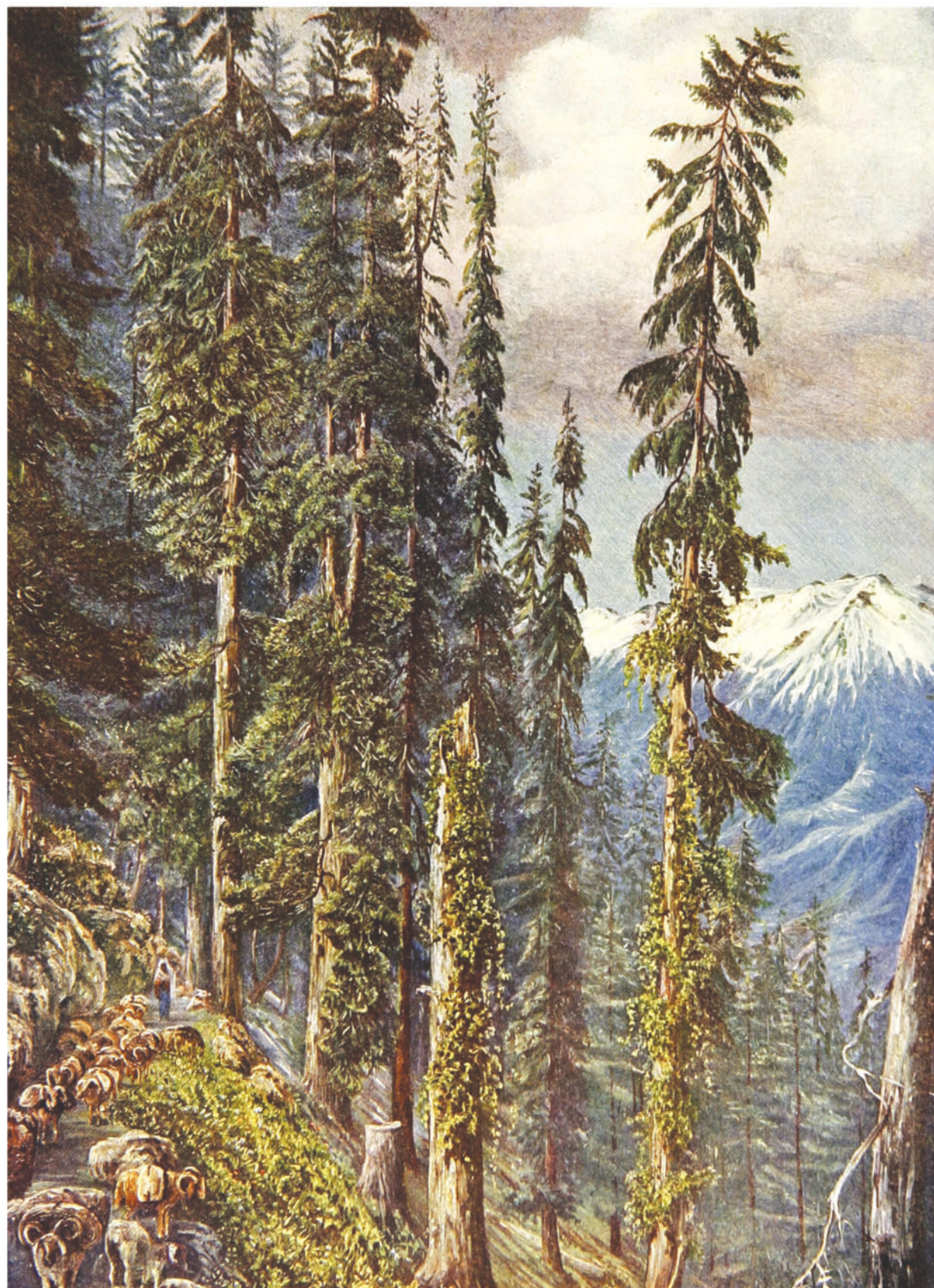
HIMALAYAN SPRUCE ON THE ROAD NEAR NAGKUNDA