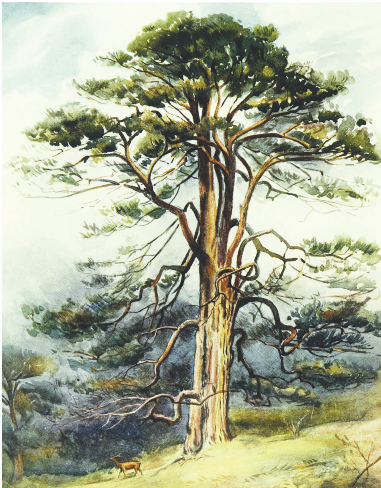
NATIVE SCOTS PINE AT INVERGARRY