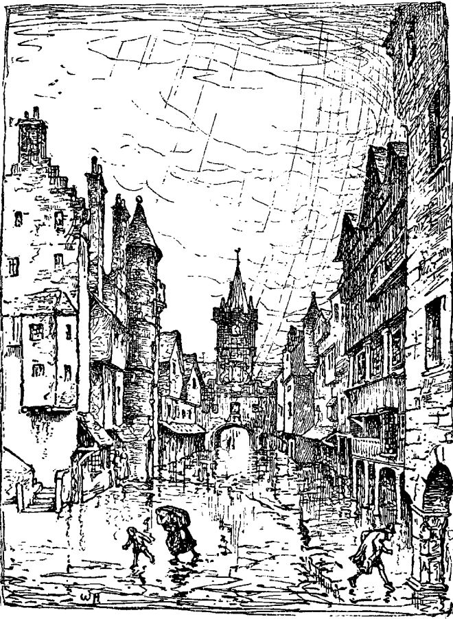
VIEW IN 'OLD EDINBURGH' STREET.