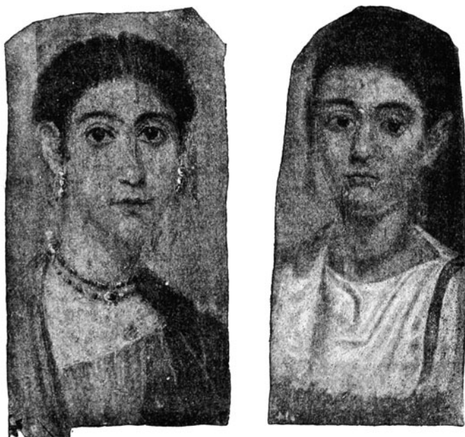
PORTRAITS PAINTED IN WAX, FROM ROMAN MUMMIES, HAWARA.