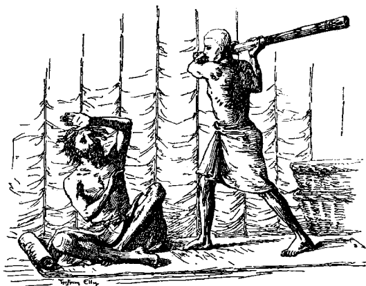
SMITING THE FOE

head of the Foe in Joppa, and he fell helpless before him. He put him in the sack of skins and he bound with gyves the hands of the Foe in Joppa, and put on his feet the fetters