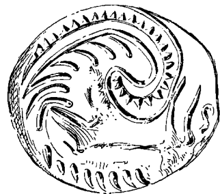
Steatite bead-seal from near Knossos L.M. III b (2)

Referred to this epoch is also the cornelian lentoid from Arkhanes, IV. 588 (Fig. 582), feline animal and ducks illustrating a further advance of L.M. II convoluted types. A remarkable dark steatite lentoid (transitional to amygdaloid) lately found in Knossos district, here given in inset, shows a