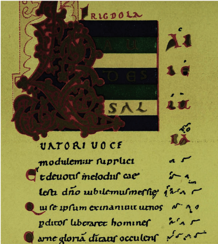
Fac-simile of the first page of Notker's "Ostersequenz" Laudes Salvatoris From the MS. 121 at Einsiedeln.