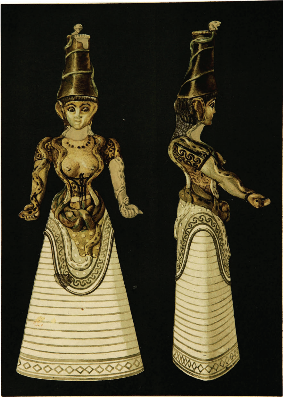
FAÏENCE FIGURE OF SNAKE GODDESS