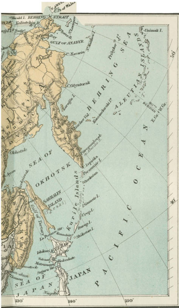
Stanford's Geog. Estab., London.