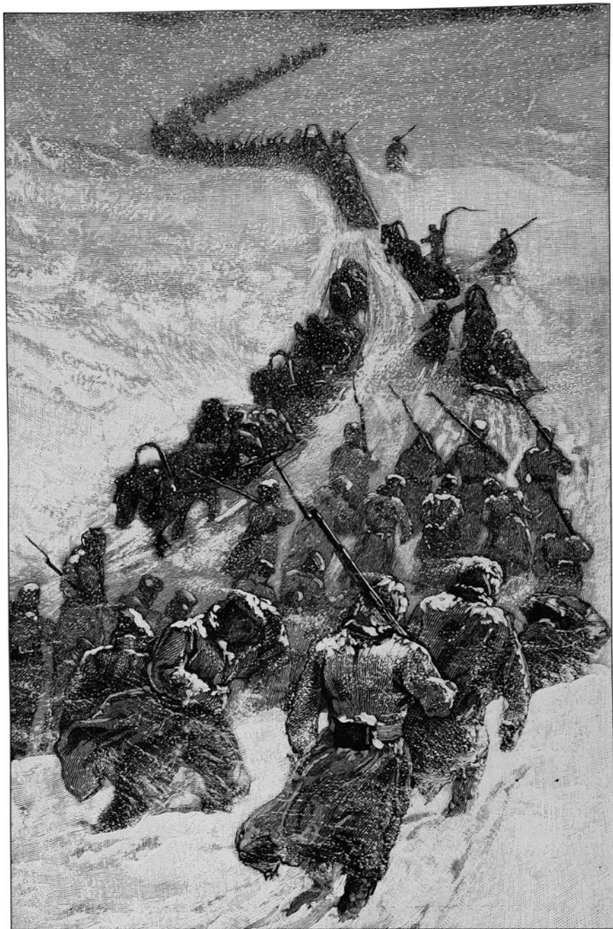
A MARCHING PARTY OF EXILES PASSING A TRAIN OF FREIGHT-SLEDGES.

Cambridge University Press 978-1-108-04823-1 - Siberia and the Exile System: Volume 2 George Kennan Frontmatter More information