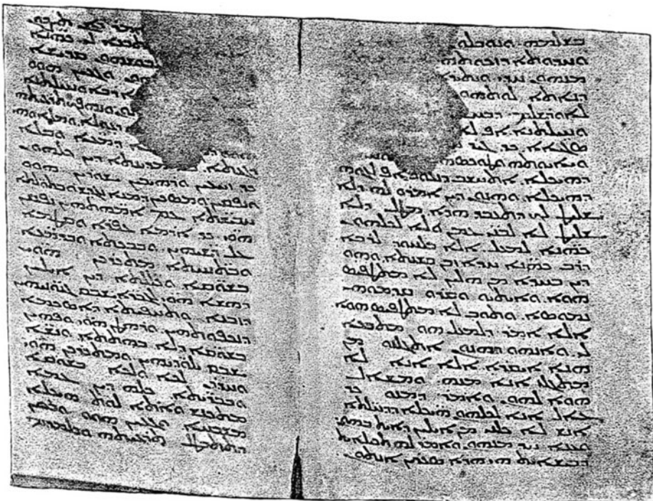
III MACCABEES I. 8—17 From a Sinaitic MS.