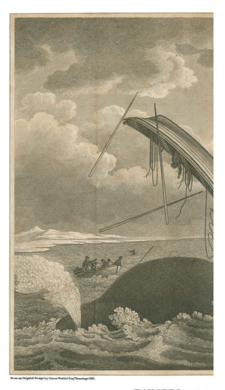
DANGERS OF THE