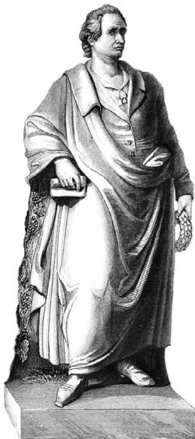
Goethe—from the statue at Frankfurt