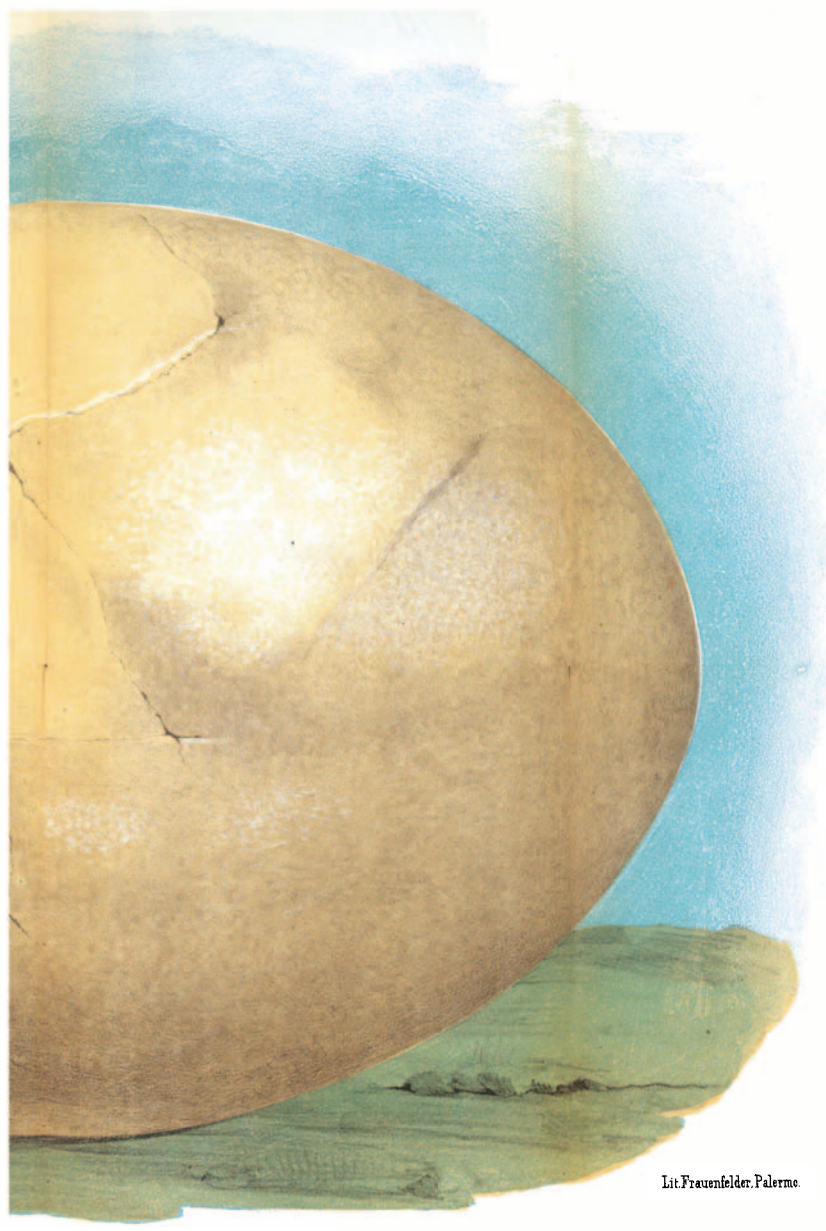
C'S ECC". - 81ZE. he ÆPYORNIS in the British Museum