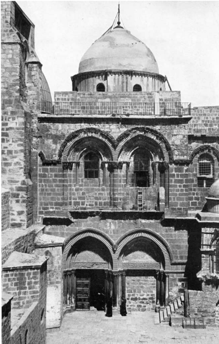
The Holy Sepulchre Church. Exterior.