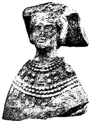
BUST OVER THE GATE OF GYROLIMNÈ.