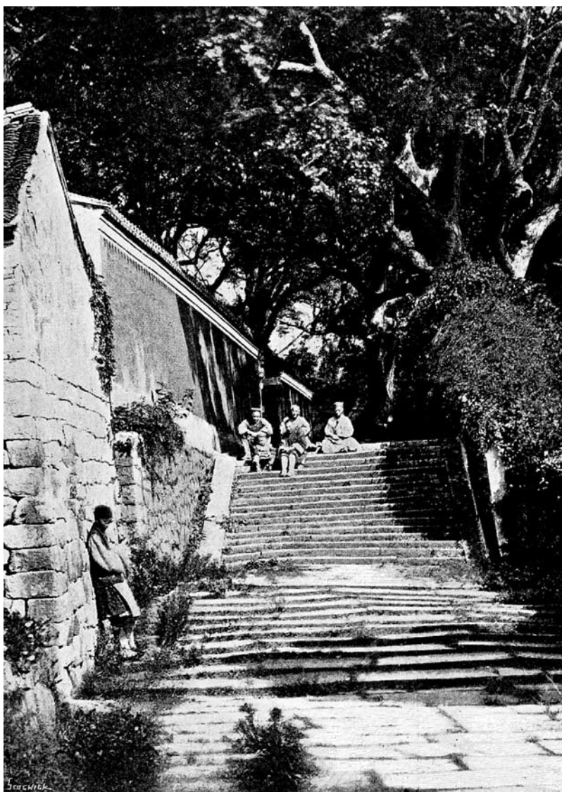
THE WAY IN.