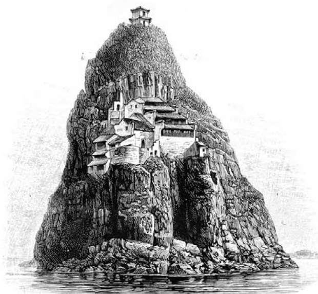
'THE LITTLE ORPHAN.'

MY BOATING AND SHOOTING EXCURSIONS TO THE GORGES OF THE UPPER YANGTZE.